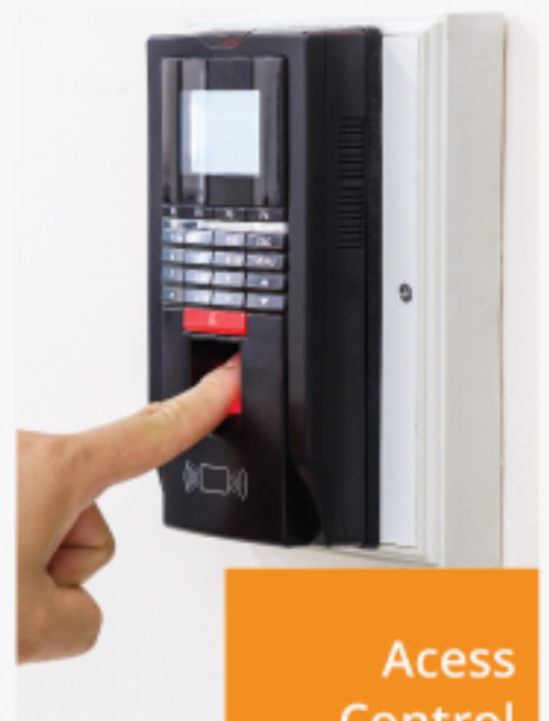
Access Control Systems