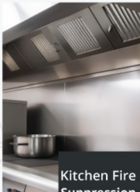
Kitchen Fire Suppression Systems