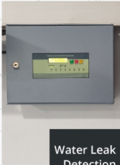
Water Leak Detection Systems

We, at Fire Systems do AMC (Annual Maintenance Contracts) for all types of Fire Safety related work along with Designing, Supply, Installation, Commissioning & consultation. We provide cost-effective & forward-looking service focusing on compliance & incident prevention.