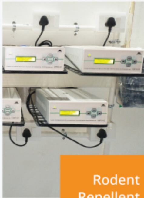
Rodent Repellent Systems